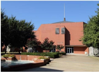
Thurman J. White Forum Building